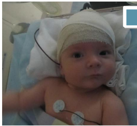
5 days after operation